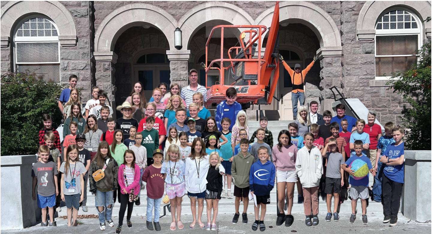
Closing Social - mid August - Challenge 2024